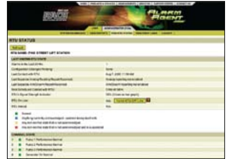
WRTU Status Screen Get the complete status of your WRTUs anytime.

report — Generate comprehensive reports on-demand with just the click of a mouse.