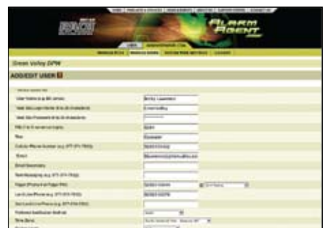
Add a User Screen Easily change user permissions and preferences.